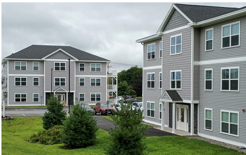
Figure 3. Gracelawn Apartments, Auburn Maine

At a much larger scale, Houston’s longstanding policy has been to allow apartment buildings everywhere. Some parts of that huge city have a potpourri of housing types; other parts were built homogenously. On the surface, Houston’s all-of-the-above approach looks similar to other cities’ multifamily districts, which technically allow single-family and middle housing. But in other cities, the scarcity of multifamily land means that less-dense construction is not viable. Houston shows that single-family and townhouse construction can thrive alongside multifamily uses when land for all types is abundant.