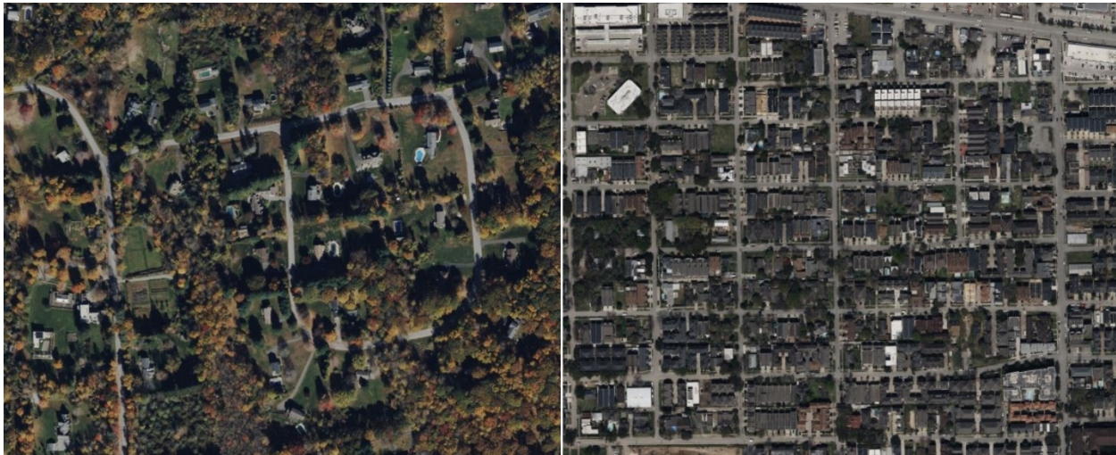
FIGURE 1. Single-Family Forms of Bethlehem, Connecticut (left), and Houston, Texas (right), at the Same Scale