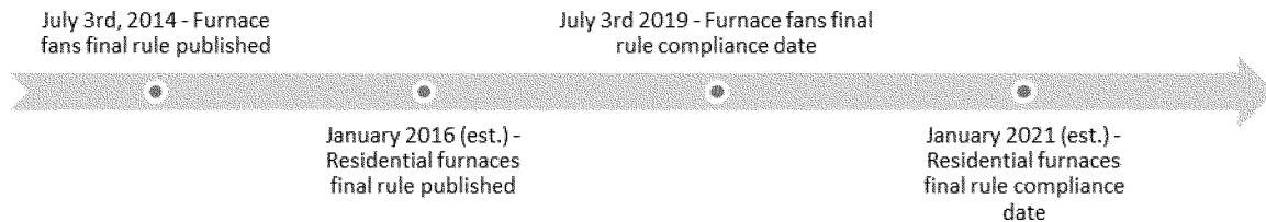
Figure V.1 Compliance timeline for furnace fans final rule and proposed residential furnaces rule

In considering this level, DOE notes that the agency recently published a final rule for energy conservation standards for furnace fans. 79 FR 38130 (July 3, 2014). Figure V.1 illustrates the compliance intervals of both the furnace fans final rule and the proposed rule for residential furnaces.