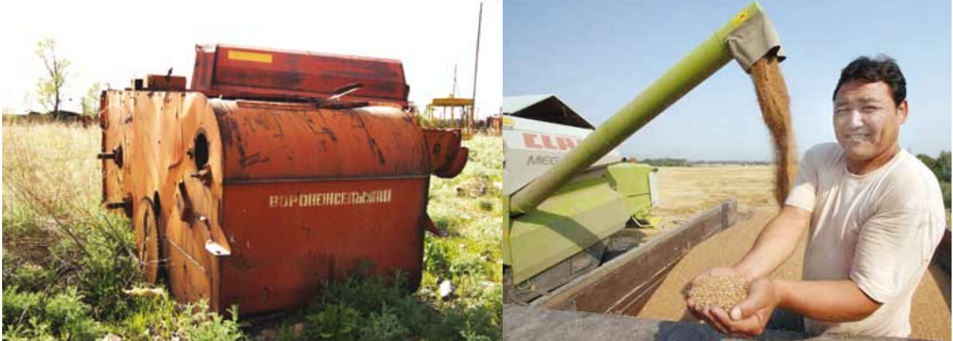
Decline and Rise of Agriculture: Left, bankrupt former kolkhoz in the Almaty region. Right: restructured large-scale agricultural enterprise in Northern Kazakhstan using western production technology.

Due to privatization and farm restructuring, the number of collective farms has fallen. The area farmed by them also shrank from 92 percent in 1995 to 66 percent in 2001 and to 51 percent of Kazakhstan's total farmland in 2006. Family farms, on the other hand, grew rapidly and now about 48.1 percent of cultivated land belongs to individual farms. Household plots use about 0.7 percent of all agricultural lands. 203 In 2006, large-scale agricultural enterprises accounted for only 25 percent of all agricultural production, while household plots for 54 percent and peasant farms for 21 percent. However, corporate and peasant farms produce most crops (83 percent and 84 percent of total output, respectively), while household plots are predominantly engaged in animal production (78 percent of total output). 204