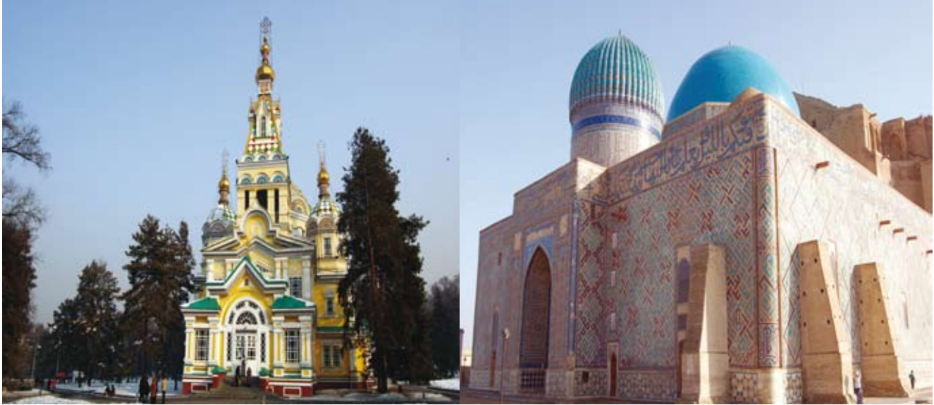
Peaceful co-existence of Christian and Islamic culture: a Russian-Orthodox cathedral in Almaty's Panfilov Park and a mosque in Turkistan.

This has yielded stable relationships with all of its neighbors. Nevertheless, Kazakhstan still considers Russia its most important international partner, with whom—as President Nazarbayev often points out in official meetings with Russian counterparts—Kazakhstan has no disagreements at all, neither political nor economic. Russian President Dmitri Medvedev made his first international trip to Kazakhstan after taking office in May 2008, indicating that the Russians also value their relationship with this southern neighbor. 17