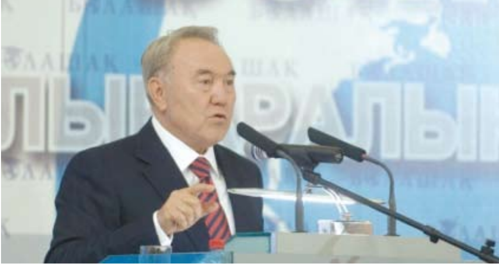
President N. Nazarbayev at a forum for holders of the President's "Bolashak" ("Future") scholarship, which enables young, talented Kazakhstani to obtain high-quality education at foreign universities.

ern democratic romanticism" (approximately until 1995), presidential power gradually strengthened and the influence of state legislative bodies declined. 24 In June 2007, a clear authoritarian turning point, Kazakhstan's parliament passed a law granting Nazarbayev lifetime powers and privileges, including immunity from criminal prosecution and the right to call a successor. 25 Nazarbayev can act as his successor's advisor, continuing to influence domestic and foreign policy. 26