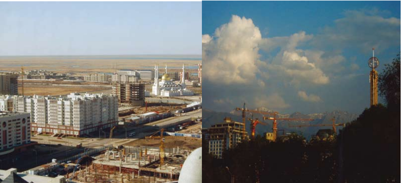
Construction boom in the two major cities: Left, the new capital Astana in the northern steppeland. Right, the southern "capital" and financial center Almaty at the bottom of the Tien Shan Mountains.

in July 2003, the Financial Markets Supervisory Agency (FMSA) was formed, and, as of January 1, 2004, it took responsibility for most of the supervisory and regulatory functions in the financial sector (previously performed by the NBK). This new and enforced institutional framework has cut the number of banks from 210 in 1994 to 36 in September 2008. No other country has reduced the number of banks as quickly as Kazakhstan. Sixteen of these 36 banks are in a NBK-sponsored deposit insurance scheme. Five large banks (Kazkommertsbank, TuranAlem (BTA), Halyk Bank, Alliance Bank, ATF Bank) dominate the sector and account for 79.5 percent of total assets of the banking sector. 180