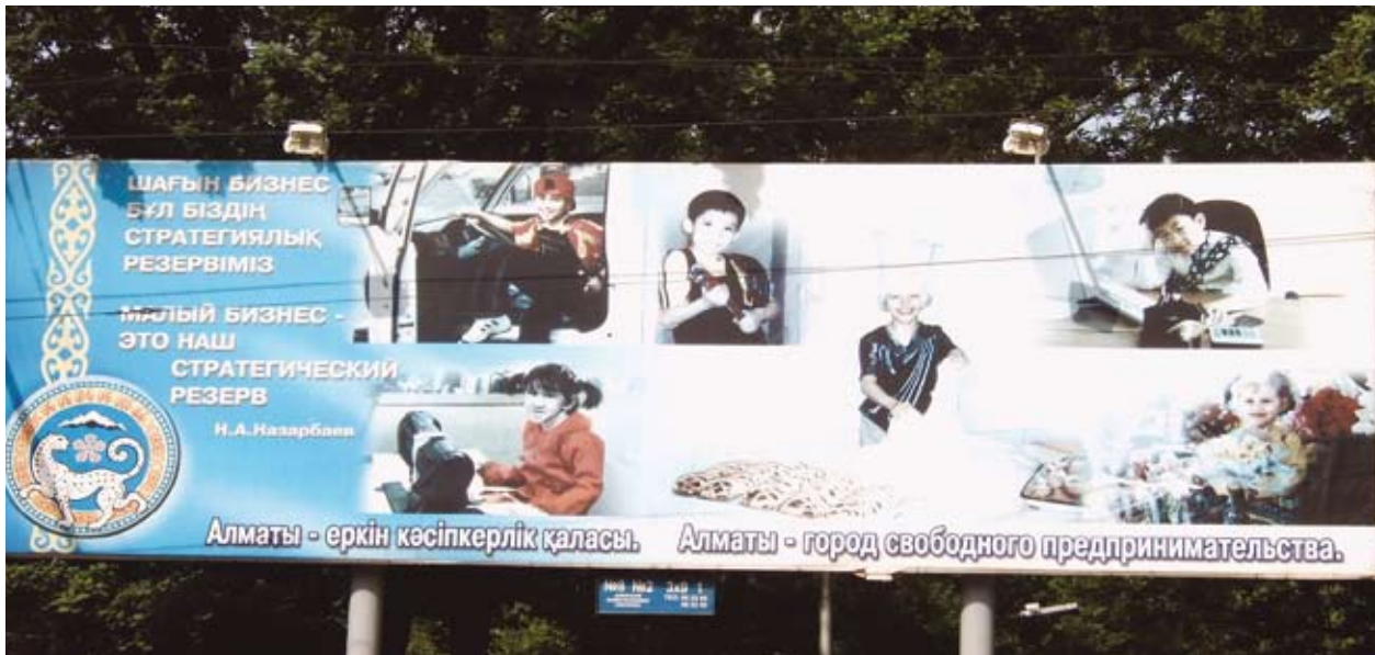
Advertisements like these with quotations from President Nazarbayev's speeches are a common sight. This one praises Almaty as the city of free entrepreneurship and small business as the strategic reserve of the country.

A single investment regime for domestic and foreign investors is a positive change, as it helps to provide equal conditions for all actors. 103 On the other hand, the vague formulation of the “grandfather’s clause” and the amendments giving greater discretion to government officials are problematic, as they don’t provide stable expectations. 104 In spite of these regulations, foreign investors in general still consider the investment climate in Kazakhstan positive. Neither the German Association of Entrepreneurs nor the German Embassy in Kazakhstan knows of cases of severe arbitrariness from government officials against foreign investors. In fact, international agencies and organizations consider Kazakhstan the CIS country with the most favorable environment for investment.