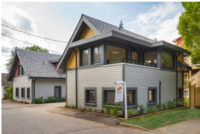
Figure 4. Laneway Homes in Vancouver