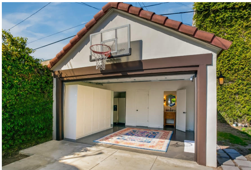
Figure 2. A Converted Garage in Los Angeles